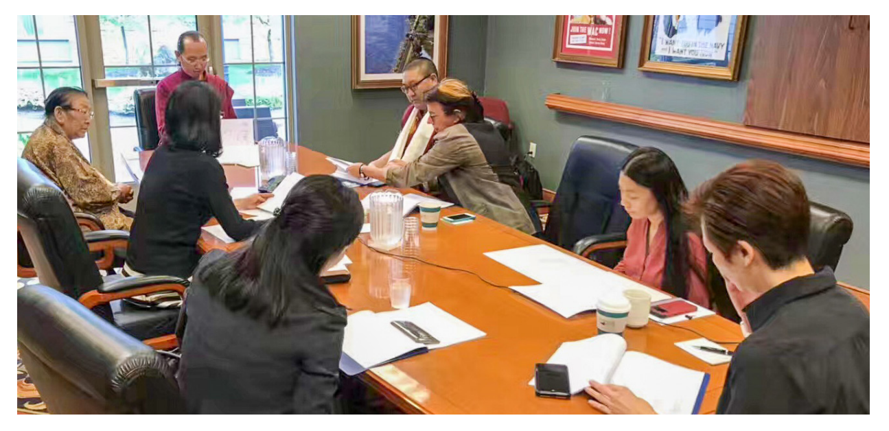
Foundation board meeting

Sachen Foundation would not be where it is today without the hard